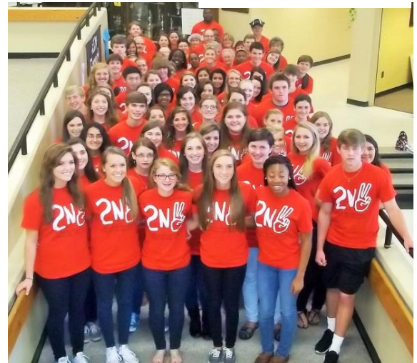
Students and faculty wearing "Celebrate My Drive" T-Shirts