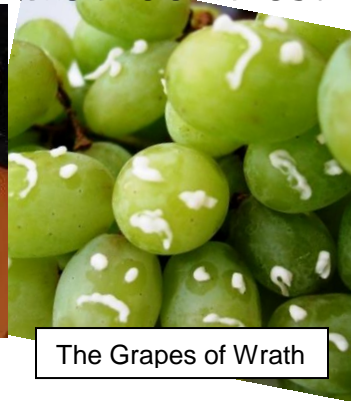
The Grapes of Wrath