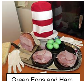
Green Eggs and Ham