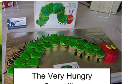
The Very Hungry Caterpillar